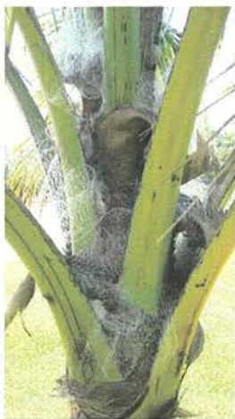
Figure 7. Bow tie placed into pockets where fronds attach to trunk.