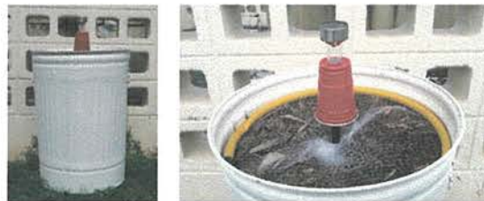
Figure 4. CRB Barrel Trap.

Barrel traps can be built using recycled 55 gallon metal oil barrels, plastic barrels, or large heavy duty trash cans. Barrel traps are filled with decaying coconut or other organic material up to 6 in from the top. The barrel is then covered with a small piece of tekken netting, wrapped securely around a piece of garden hose cut to size to fit inside the barrel for more stability. A solar-powered ultraviolet light emitting diode (uvLED) and a CRB pheromone lure should be added to increase its effectiveness. If desired, traps can be painted decoratively to be more presentable.