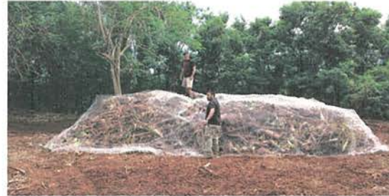
Figure 2. Tekken net covering a large pile in fresh organic material.

A gill net called “tekken” in Chamorro, with a 1 in mesh measured knot to knot, made from 0.25 mm nylon monofilament, should be laid over piles of green waste such as palm tree cuttings or decaying organic matter (Figure 2). Green waste piles are very attractive to rhino beetles looking for a mate and/or egg-laying sites. A beetle trying to get in or out of the pile will become trapped when the monofilament drops into the gap behind its prothorax (Figure 3), the same way that fish are caught in gill nets.