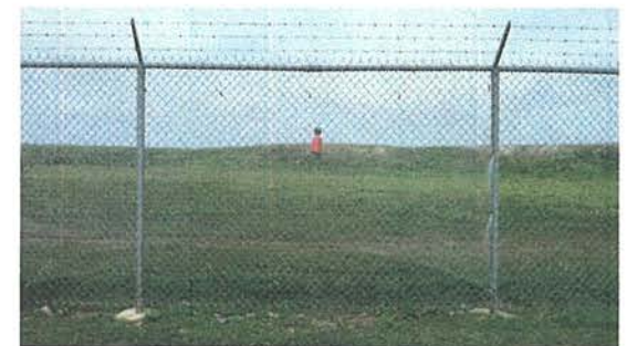
Figure 5. CRB DeFence trap.

The DeFence traps are simply constructed with a 12 ft piece of tekken netting, folded in half, and secured onto a fence line using zip ties. In the middle of the net, attach a solar powered uvLED light, and a CRB pheromone lure protected in a red Solo cup. This trap is currently the most effective because it does not require many materials and uses the least amount of space on the property.