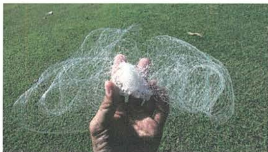
Figure 6. Tree bow tie with 2 in rock in the middle.

Tree bow ties are assembled by taking a 3 ft x 3 ft piece of netting, place a 2 in rock (or anything that can weigh down the netting) in the center of the net, and tie 2-3 knots. Place the bow tie in between each pocket where the base of the frond attaches to the trunk of the palm tree, throughout the whole tree top. These traps will capture the beetles as they try and burrow their way into the tree to feed.