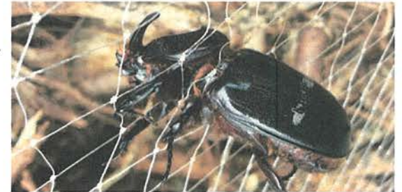
Figure 3. CRB caught in tekken netting.