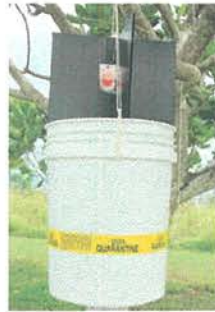
Figure 1. Standard Pheromone Trap.

The Standard Pheromone trap (Figure 1), was the best form of trapping for the Coconut Rhinoceros Beetle back in 2007, during the early eradication efforts. However, research has shown that these traps do not effectively attract the beetle enough to reduce or control its population.