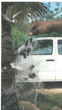
Figure 8. CRB caught in bow ties.